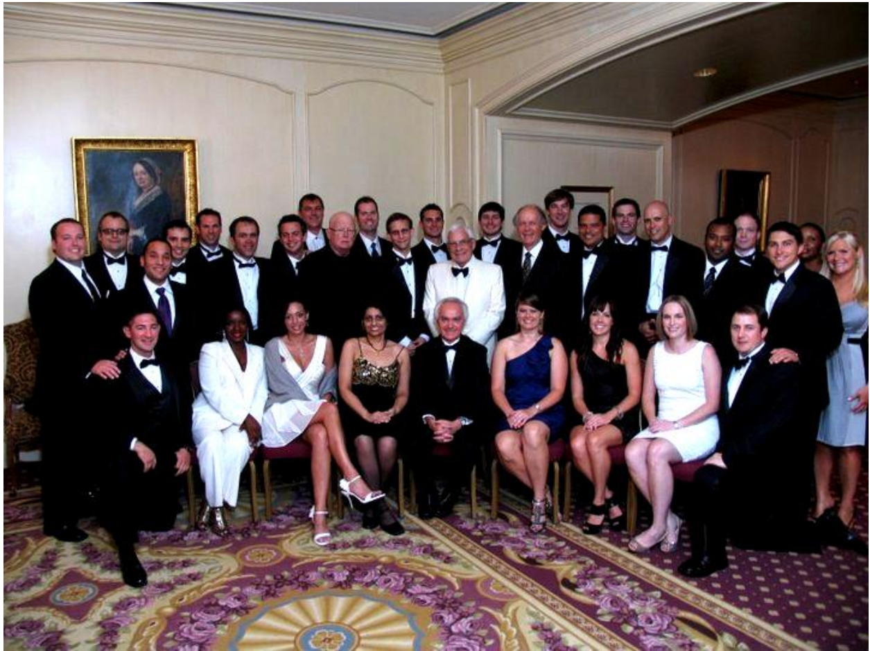
Department of Orthopaedic Surgery Faculty, Staff, and Residents